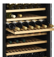
Wooden drawing shelves